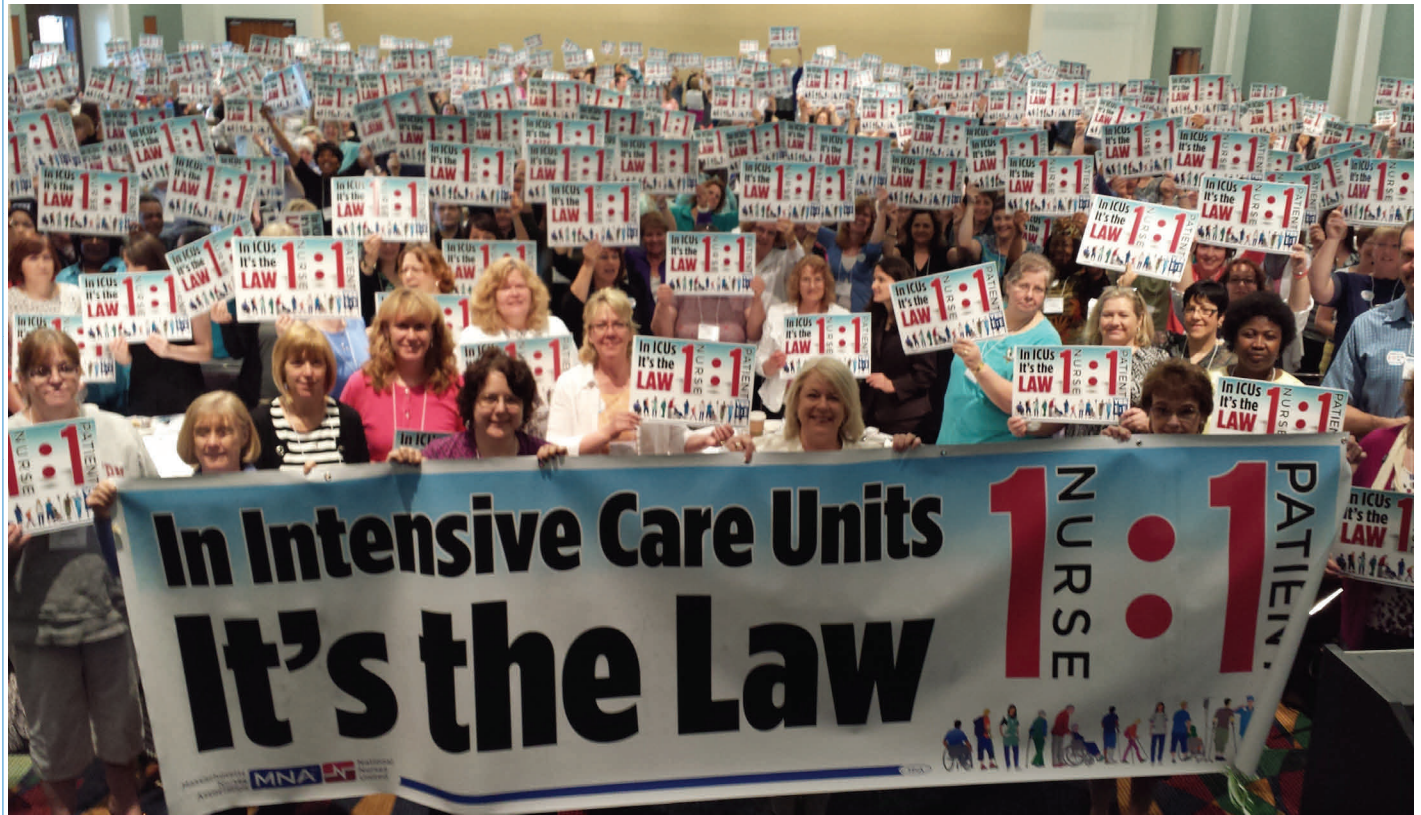
MNA Nurses kick off the “ICU Law: One Nurse to One Patient Sticker Campaign” to educate the public that if and when their loved ones are in the ICU, they should expect one on one attention from an RN – it’s the law.

REGION ONE NURSE is published three times a year by Regional Council One. It is a publication made available to MNA Region One members to inform and meet member needs by providing information on nursing, health care, and labor issues. We invite our members to submit items to the newsletter, especially through the editorial voice. A strong democratic union requires an informed membership. All submissions are subject to editing and none will be returned. For more information contact the Region One office at 413-584-4607 or email: region1@mnarn.org