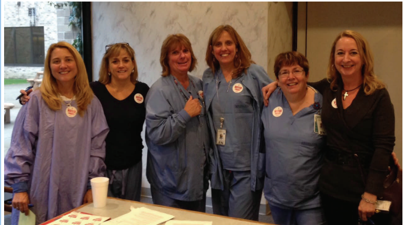
Pictured above and bottom left: Mercy nurses after participating in the ratification process.

Contract was ratified on Monday, November 24, 2014. Highlights include: An annual across the board increase spread over three years, a new pension plan that has a 3% hospital “core” contribution regardless of whether an RN contributes or not, an increase in 3-11 shift differential, an increase in Preceptor Pay and a $250.00 bonus for taking the class on work time, increases in Degree Differential that will benefit over 1/3 of our members, revisions to the Mandatory OT Language to comply with the 2012 Law, and increases to Tuition Reimbursement.