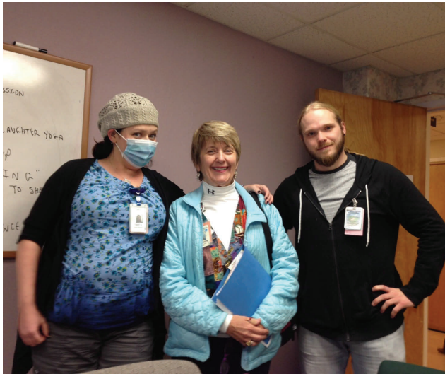
Providence Hospital nurses after participating in the ratification process.